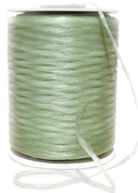
Tape TSE 200