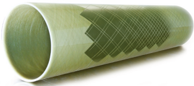
Glass-epoxy tubes FRP