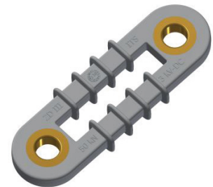
Buckle traction insulator