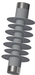
KWIS apparatus support insulator