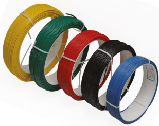
Electrical insulating sleeves