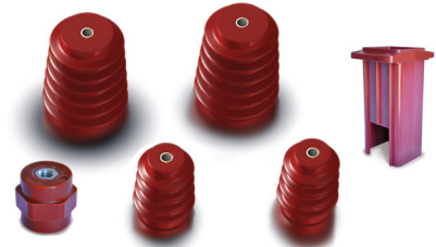
Epoxy post insulators